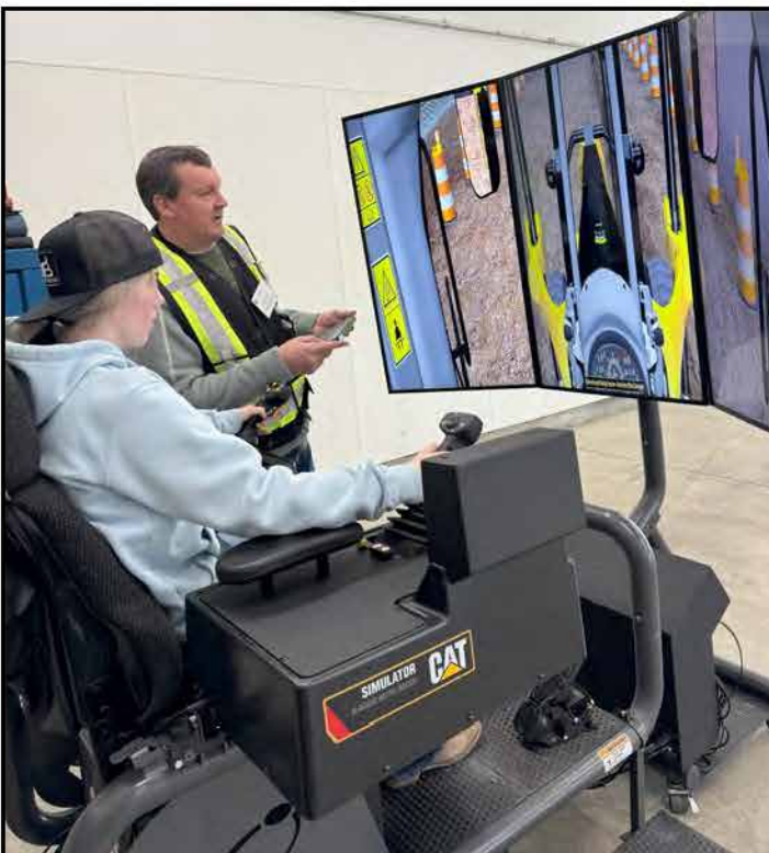
Finning Caterpillar's state of the art grader simulator was a highlight at the Special Areas Career & Trades Day.

Protective services introduced students to the role and importance of the volunteer fire departments in Special Areas and encouraged them to explore the various equipment and vehicles utilized. Students also received instruction in correct fire extinguisher use and were able to use extinguishers to fight a fire in a live-fire training prop.