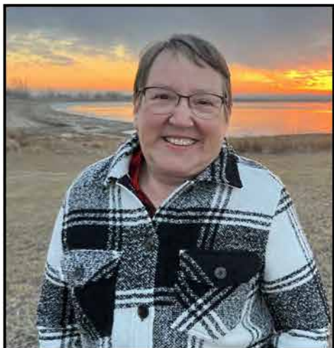
Prairie Land Pride