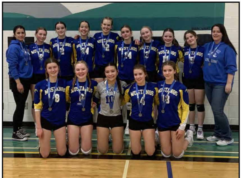
The Senior Girls Morrin Mustangs Volleyball team earned an impressive 2nd place finish at 2A Zones.

With strong academic programs, expanding opportunities, and a committed community, Morrin School continues to be a place where students grow, achieve and thrive.